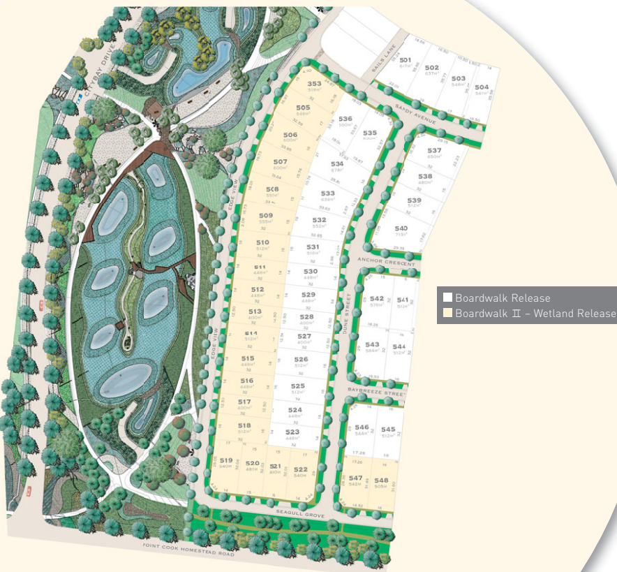
Stage plan and master plan not to scale.

Boardwalk Release and Boardwalk II Wetland Release now selling